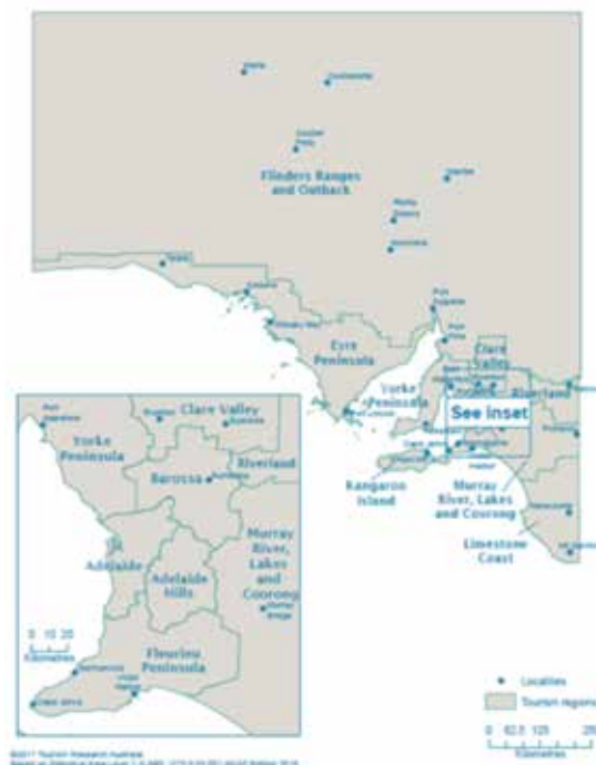
Table 3: South Australian tourism campaign regions

We used the campaign regions because they provide a reasonable level of geographic coverage that matches data availability. Data availability and quality deteriorate with datasets that aggregate tourism activity at smaller geographic scales.